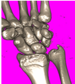
A 3D wrist CT performed at Guilford Radiology, 2010

Upper Extremities CT examines the hand, wrist, forearm, elbow, humerus, shoulder and clavicle. Lower Extremities CT examines the hip, knee, ankle and foot.